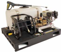
HD Pallet Skid with Tank 0