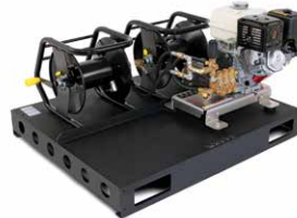
HD Pallet Skid with 2 Hose Reels 1