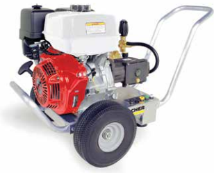
Direct Drive Cart and Skid