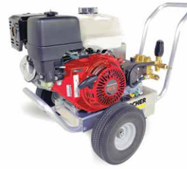
Belt Drive Cart and Skid