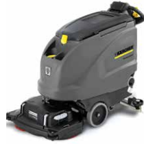
B 60 W BP