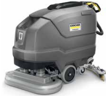
BD 80/100 W BP CLASSIC