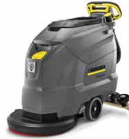
BD 50/50 CLASSIC BP